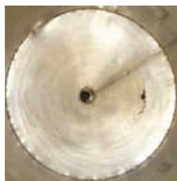
Mobil DTE 10 Excel™ Series 2,500 hours

In demanding proprietary MHFD testing, Mobil DTE 10 Excel™ Series hydraulic oils outlast competitive mineral-based products, keeping systems cleaner more than three times longer.